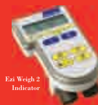
Ezi Weigh 2 Indicator