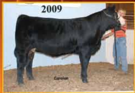
CASONS MISS SHAWN U29S

Any junior that purchases a heifer at the 2009 Hawkeye Sale and wins either Grand or Res. Grand Heifer in the Purebred or Foundation Division at the 2010 AJSA National Classic in Des Moines will receive DOUBLE sale credits for the 2010 Hawkeye Sale!