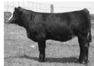
1/09 - Triple C Invasion x Meyers Red Top

Visit www.specht.webs.com for more info and a sale listing, or call Nick at 563-543-1344.