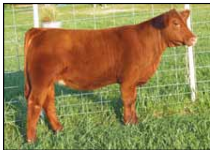
Lot 23 March DJ Salute Heifer

Kirkwood Community College Tippie Beef Center Cedar Rapids, IA