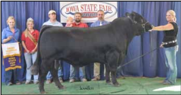
Grand Champion & Iowa Grand Champion Bull - VanAernam Simmentals of Exira and JS Simmentals of Prairie City, IA