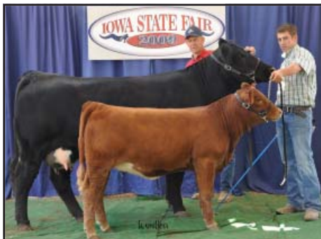
Reserve Iowa Champion Cow-Calf - Cason's Pride & Joy Simmentals of Albia, IA