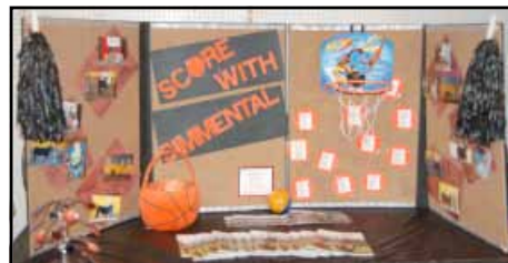
Iowa Booth at Nationals