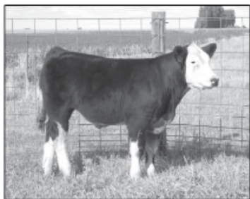
Hired Man x Sim.

Featuring approximately 15 registered Simmental steers and Foundation heifers. All Simmental calves are eligible for the Iowa Junior Futurity Show.