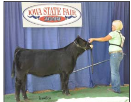
Reserve Iowa Champion Foundation Female - Ruby Cattle of Murray, IA