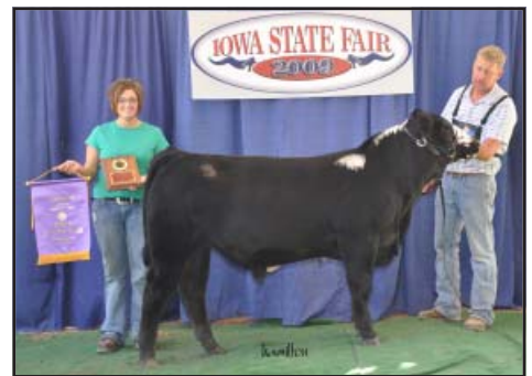
Reserve Iowa Champion Bull - RB Simmentals of Correctionville, IA