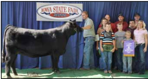
Grand Champion Foundation Female - Oak Meadow Farm of Harmony, MN