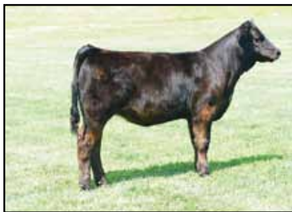
Lot 15 April S.O.S Heifer