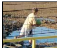
Greased Watermelon Contest