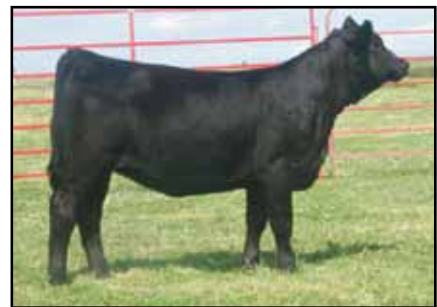
Lot 28 February Freedom Heifer

Featuring 60 Lots of Registered Simmental & Club Calf Cattle. Including Open Heifers, Steers, Bred Heifers, & Genetic Lots!