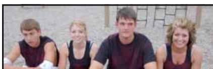
4-on-4 Basketball Team