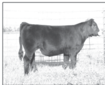
Macho x Angus Donor 243