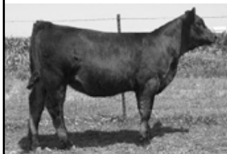
2/09 - Wheatland Bull 680S x PCC Night Moves

October 2, 3, and 4 (Initial Bids due by 7pm Oct. 4)