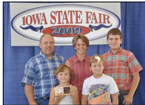
Iowa Premier Exhibitor - Long's Simmentals of Creston, IA