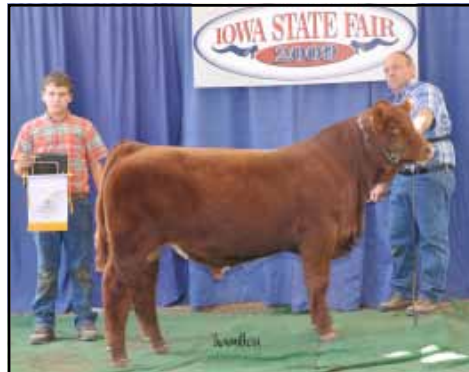
Reserve Grand Champion & Iowa Champion Bull Low %age - Long's Simmentals of Creston, IA