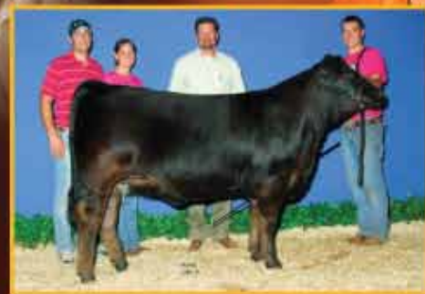
VPF/TVC KEA U38

Ch. Purebred Futurity Heifer, 2009 IJSA Field Day Res. Ch. Purebred Heifer, 2009 IJSA Field Day Res. Ch. Simmental Heifer, 2009 IJBBA Winter Beef Expo Ch. Simmental Heifer, 2009 Grinnell FFA Preview Show Ch. Simmental Heifer, 2008 Badger Kickoff Classic