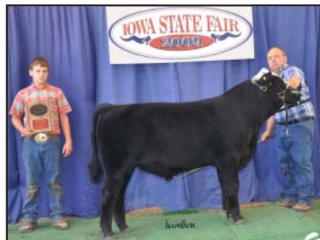
Reserve Iowa Champion Low %age Bull - Long's Simmentals of Creston, IA