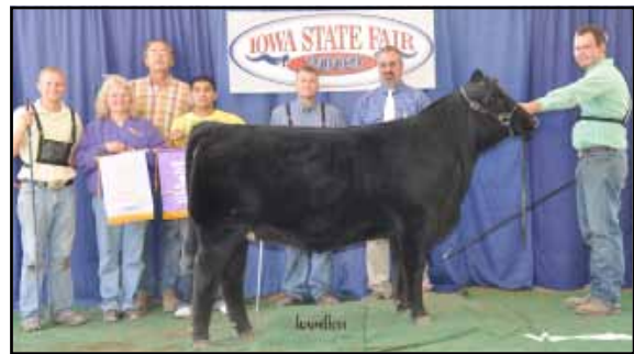
Reserve Grand Champion & Iowa Reserve Champion Purebred Female - Finesse Livestock of Geneva, IA