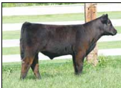
Lot 61 March Sun Seeker Steer

Give us a call to request your catalog today!