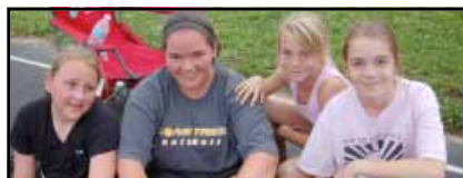
4-on-4 Basketball Team