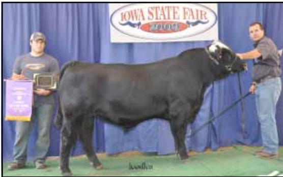
Grand Champion Low %age Bull - RS&T of Kansas City, MO