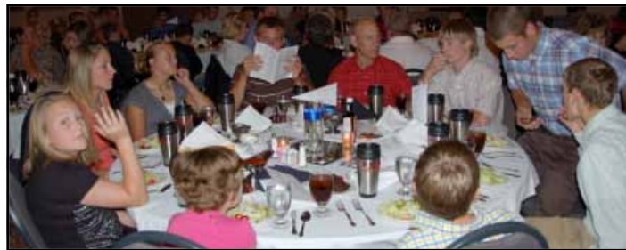
National Classic Awards Banquet