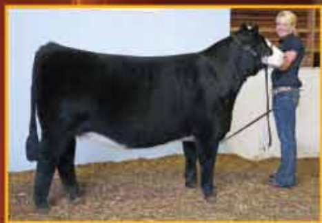
RJM MACHOS DREAM U146

Bloomfield Livestock Market Bloomfield, Iowa