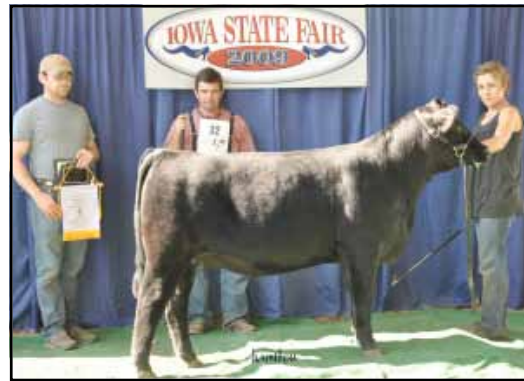
Reserve Grand Champion Foundation Female - Ratliff Ranch of Venita, OK