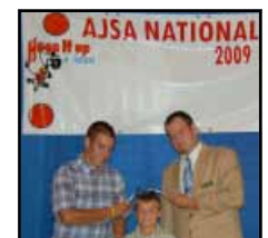
Iowa Team Fitters